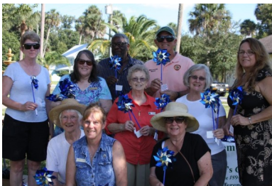
Preparing to plant